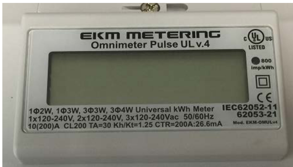
Figure 1: Display and Markings - Meter